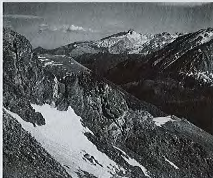
Long's Peak from north, Rocky Mountain National Park, Colorado, 1942.